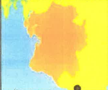
Barony of Coreomroe